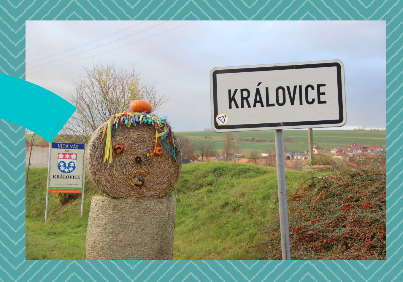
Hiding behind a small hill is the little village of Kralovice