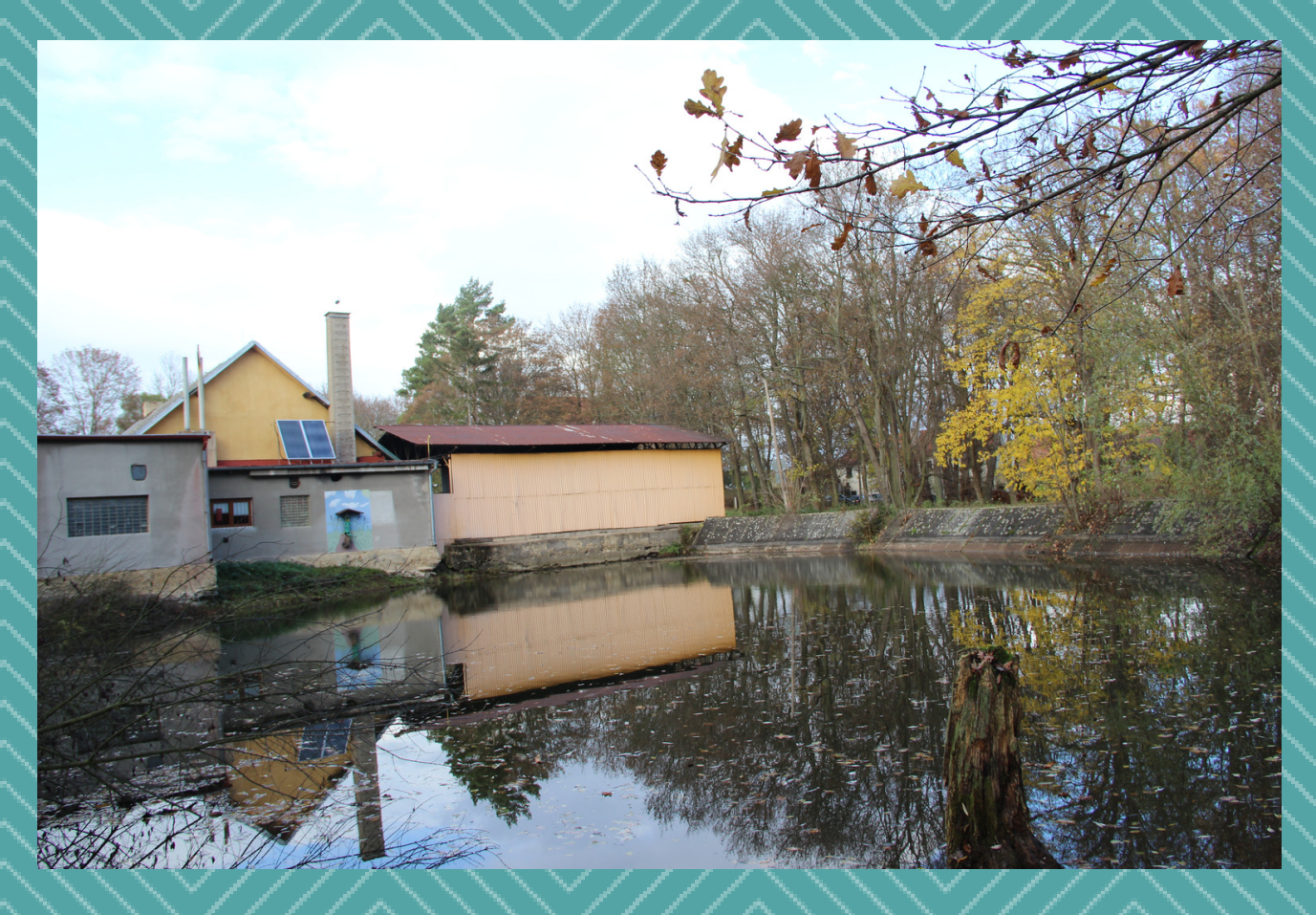
(To my disappointment, no crocodiles in the pond)